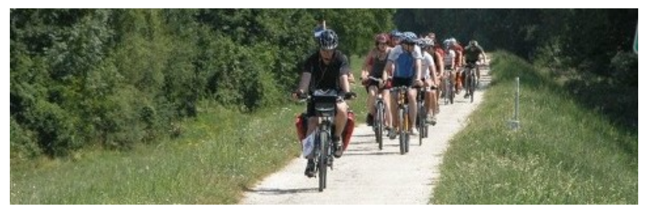
In order to see a detailed list of our stops, please proceed to chapter 10.

Our route stretched itself from the Balkans to the Russian Federation. All in all, we covered 5000 km on our bicycles in a total of 74 days. We commenced our trip on the 3rd of July 2011 in Novi Sad, Serbia and arrived in St. Petersburg, Russia in the evening of the 14th of September 2011. We passed through the following countries: Serbia, Croatia, Hungary, Slovakia, Austria, Czech Republic, Poland, Lithuania, Latvia, Estonia, Finland and Russia.