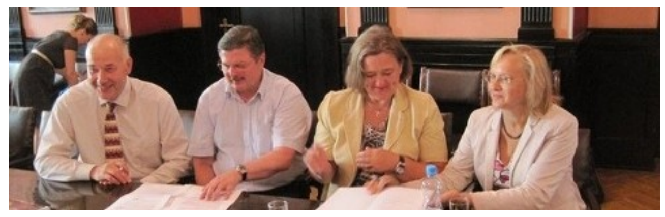
For a detailed list of our 58 distinguished supporters with whom we have established contact or met with during our tour, please take a look at Appendix 1: Ride for your Rights! - Supporters.

Firstly, we presented the content of our Manifesto and urged our interlocutor to implement necessary measures for improving and enhancing student mobility. Secondly, we asked them to support our project publicly by either signing the Bike of Honour, the Manifesto, sending us an endorsement letter or recording a video message for all viewers and followers of the tour.