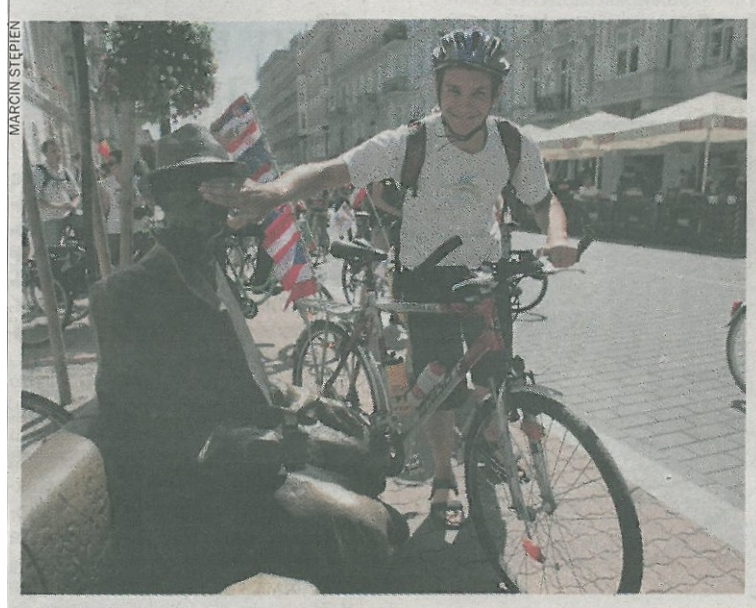
Dotknięcie nosa Tuwima na szczęście

•• Rowerzyści z 19 europejskich uczelni jeżdżą po całej Unii, wioząc manifest wzywający do zniesienia barier w mobilności studentów.