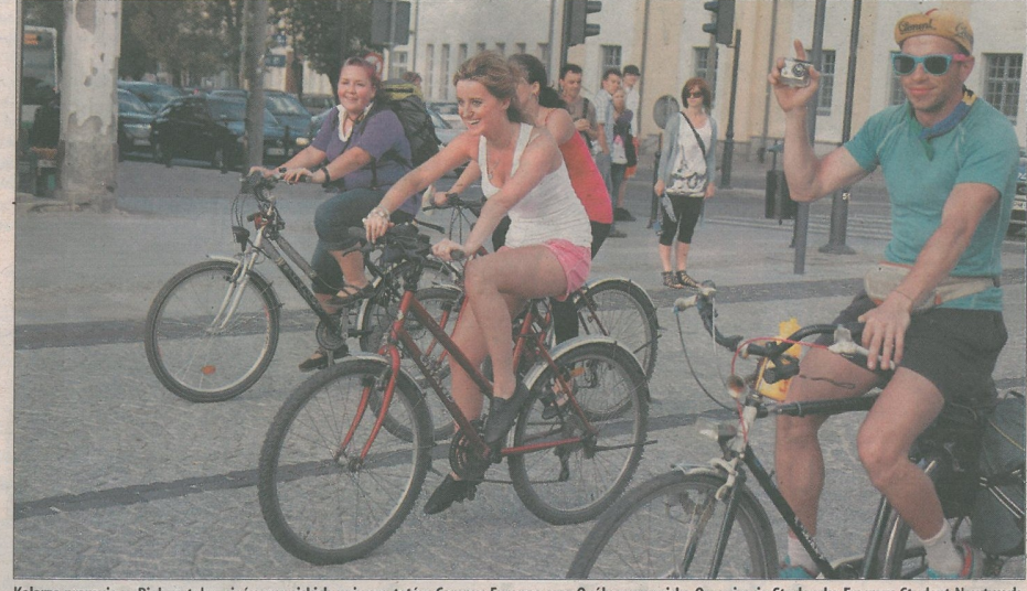
Kolarze promują w Białymstoku sieć europejskich uniwersytetów Campus Europae oraz Ogólnoeuropejską Organizacją Studencką Erasmus Student Newtwork, które pomagają studentom w wyjazdach na studia zagraniczne